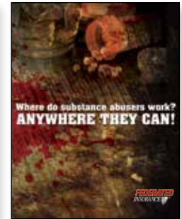
Drug- and Alcohol-Free Workplace Program

Yes! I would like to receive complimentary risk management resources from Federated Insurance.