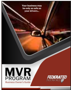
Motor Vehicle Records