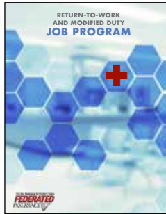
Return-to-Work and Modified Duty Program