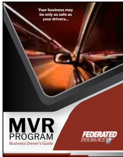
Motor Vehicle Records