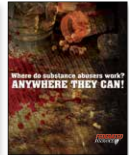
Drug- and Alcohol-Free Workplace Program

Yes! I would like to receive complimentary risk management resources from Federated Insurance.